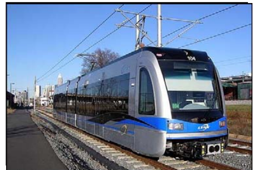
Consideration of the land uses needed to support premium public transportation options was a key objective of the project.